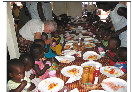
An Outing for fries and ice-cream for our 34 Toddlers – a gift from a Friend in California