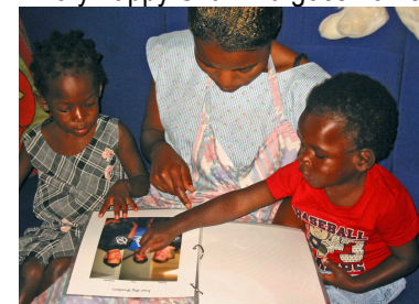
Mercy-Ben learning of family