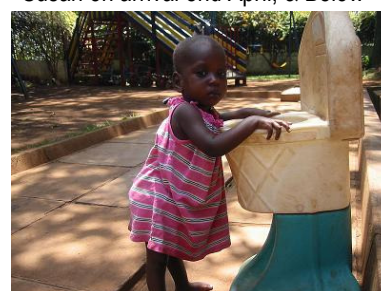
S. after 5 months learning to walk