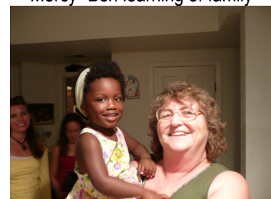
Precious now a big talkative girl