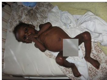
Ben at the hospital 9 months 7 lb