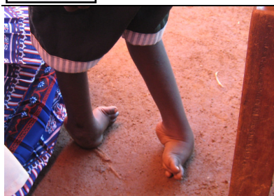
Club Feet (Rogers, below, & below left)