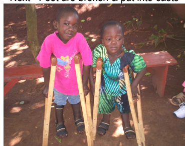
After 2 months - walking flat on their feet