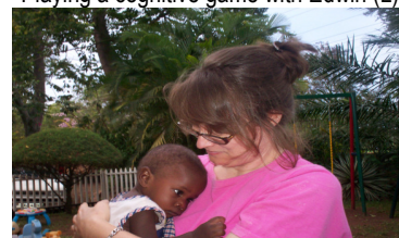
Stacy giving Cuddles