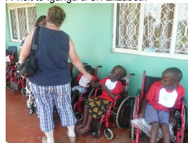
A visit to a handicapped childrens home.